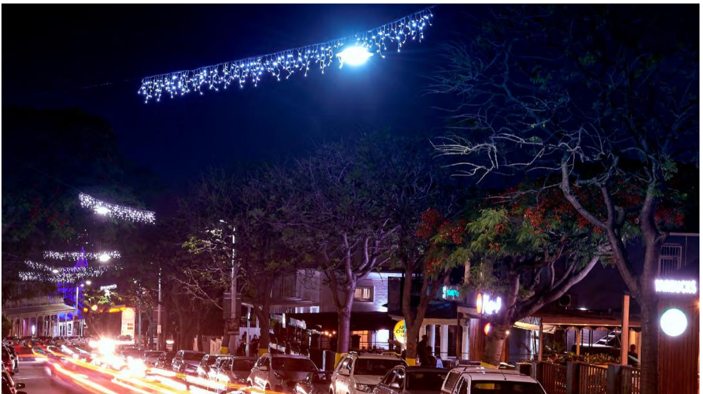
Photo below: Florida Roads festive lights up and running - an activation we hope to expand on.

Click on the links below to see news related to municipal support: